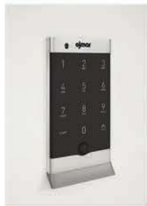
ELECTRONIC LOCK #OC-PRO