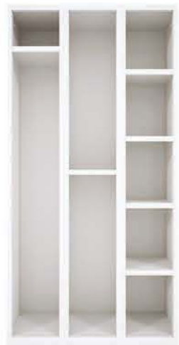
STEEL STOR SERIES