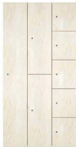
REAL WOOD VENEER 67 SERIES