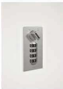
COMBINATION LOCK #RCBL-01