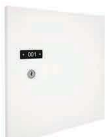
STANDARD NUMBER PLATE #033