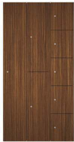
HPL/LPL LAMINATE 65 SERIES