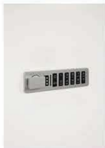
HORIZONTAL DIGITAL LOCK #MH-K2