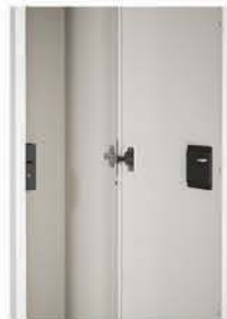
ELECTRONIC RFID LOCK #CA-7000