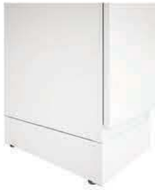
BASE WITH LEVELLERS #003-NIV