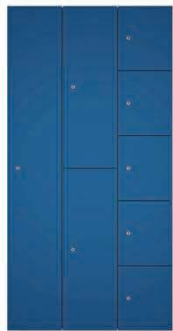
STEEL 52 SERIES