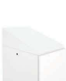
SLOPED TOP #006-OF