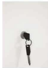
STANDARD LOCK #1205