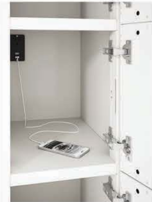
ONE POWER OUTLET TWO USB CONNECTIONS