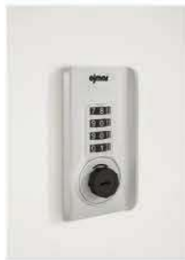
COMBINATION LOCK #COMBI-8001