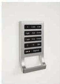
DIGITAL LOCK #DK-ATS