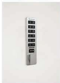
VERTICAL DIGITAL LOCK #MV-K1