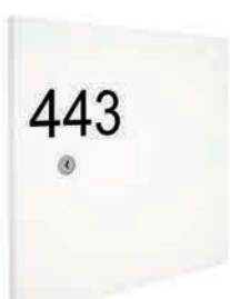
DESIGN NUMBER PLATE