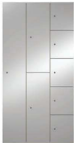
STAINLESS STEEL LAMINATE 54 SERIES